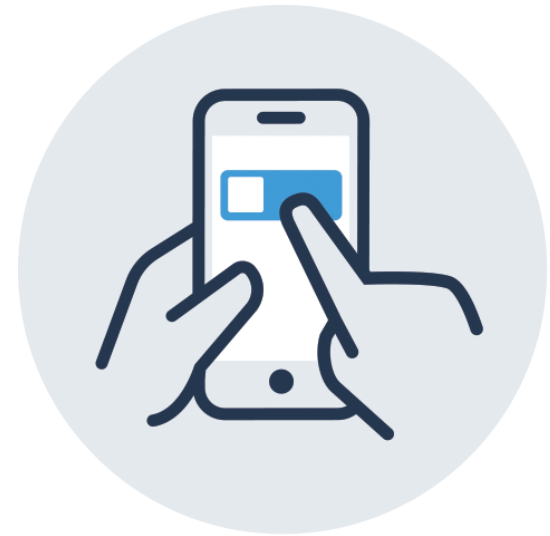
Click the pop-up