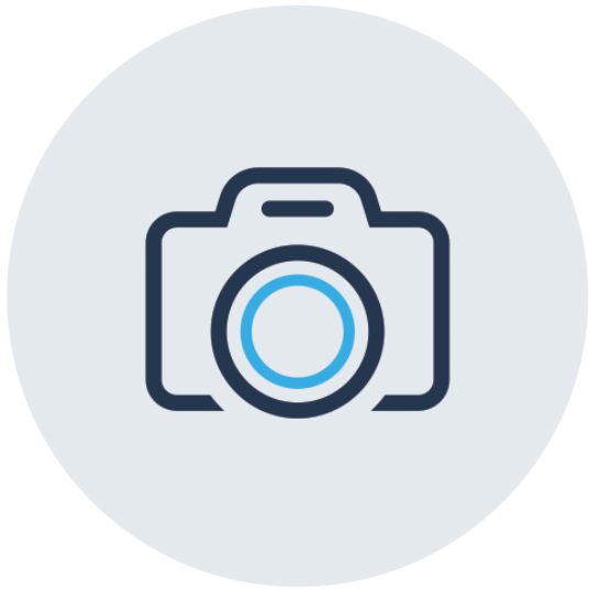
Turn on camera app