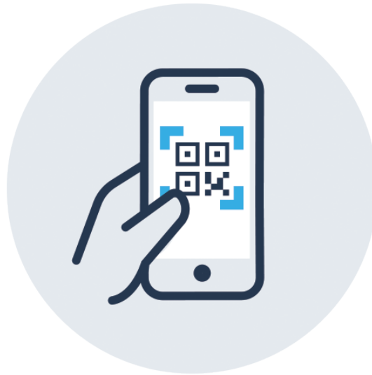
Frame the QR